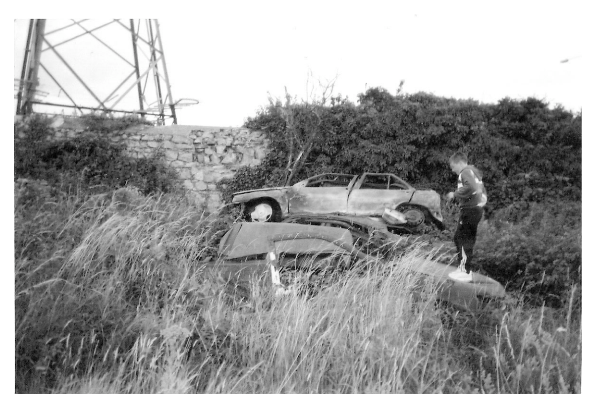
"Little in the way of positive intervention is available to those who complain or to those who are the subject of complaints."