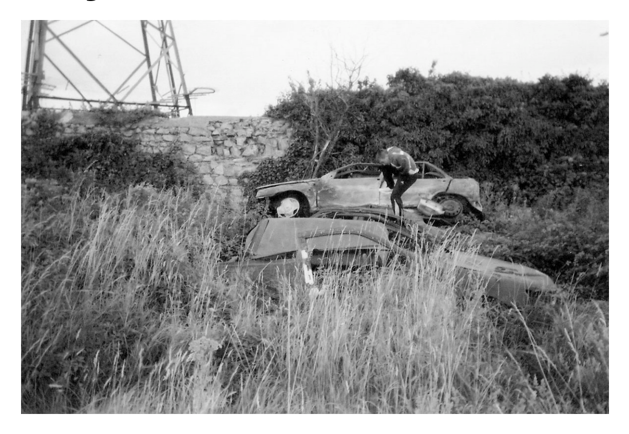
"For older children and teenagers, the space and opportunity for socialising, rather than the equipment, is the most important consideration. This group has almost no facilities provided for them and the only place in which to hang out in the evening are green areas and street corners. This often results in complaints from the public about noise and nuisance, alienating further young people who have nowhere to go. The introduction of Behaviour Orders under the Criminal Justice Act, 2006 further compounds their difficulties using these public spaces."