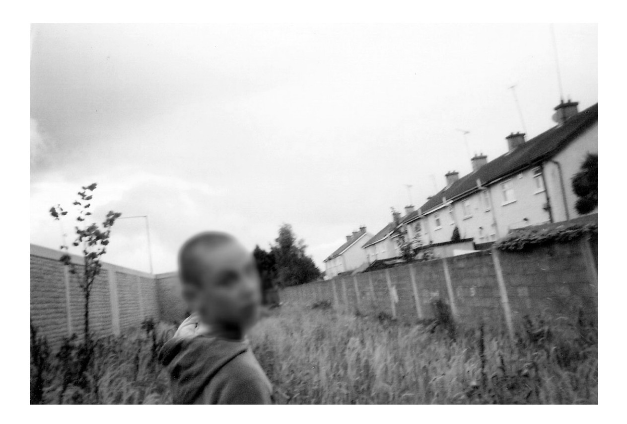
"Youth, no less than adults, have a stake in their communities. We can – indeed we must – engage youth in ways that draw on their inherent creativity and drive."