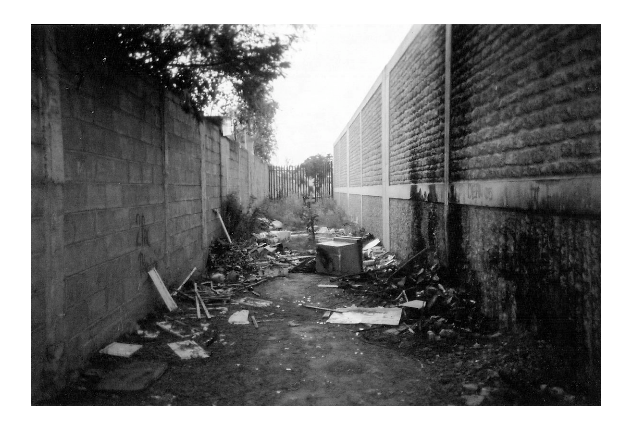
"That these neighbourhoods should have become so besieged is the product of the decades of the ill-considered housing policies behind the concentrating of large numbers of families with high levels of need while offering little social support and few if any amenities. Housing management policies that make enabling tenant purchase the priority rather than fostering life-affirming, sustainable, neighbourhoods only render the situation more difficult."