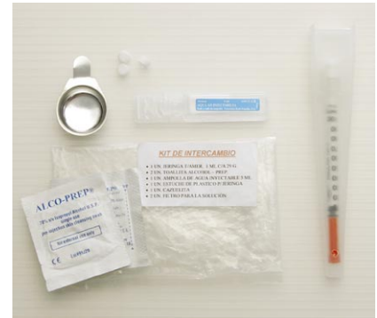
Harm reduction kit, Soto de Real Prison, Madrid

First, the program guidelines do not mandate strict adherence to one-for-one exchange. While they advise that “the rule should be exchange, i.e., the previous syringe must be returned before a new kit is handed out,” they also recognize that “a flexible attitude should be maintained towards [the one-for-one rule’s] application