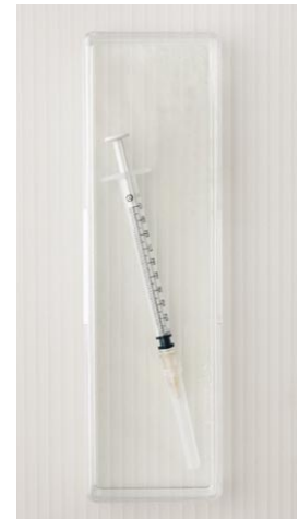
Any syringe found outside its plastic safety box is considered illegal. Hindelbank Prison, Switzerland.

Prison needle exchanges continue to operate without incident in the seven prisons identified above. Some of these have adapted their programs based upon experience gained over several years. Hindelbank, for example, will now provide prisoners participating in the program with up to five additional "points" (needles) to attach to the main body of the syringe. This is to accommodate people who inject drugs and who may have trouble injecting due to difficulty finding veins. In such cases, the user may need to make several attempts to inject. With additional "points," the prisoner need not reuse a needle that gets duller with each attempted injection. This practice has not resulted in any security prob-