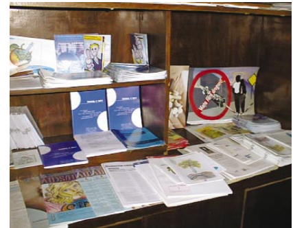
Harm reduction and HIV-prevention information, Prison Colony 18, Branesti, Moldova.

Under stage two of the program, eight peer volunteers were trained to provide harm-reduction services in four different sites in the prison. Two peer volunteers were assigned to work at each site and they are available on a 24-hour basis, as the sites are based within the prison living units (barracks-style accommodations, with 70 or more men living and sleeping in the same large room). The activities and programs are carried out in cooperation with the prison physician. The role of the physician is to act as project supervisor and as a link between the peer volunteers, prison staff, and Health Reform in Prisons personnel. In the first nine months of 2002, 65% to 70% of people known to inject drugs in the prison were accessing the program through the peer volunteers. In 2002, the peer volunteers in PC18 exchanged 7150 syringes. 208