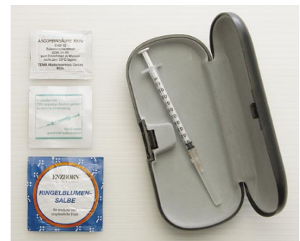
Harm reduction kit, Lichtenberg Prison, Berlin.

Based upon the success of the first projects, needle exchange programs were implemented in several other German prisons.