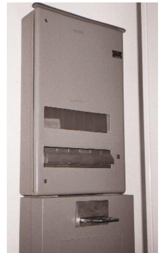
Automatic syringe dispensing unit, Saxerriet Prison, Switzerland

Staff have realized that distribution of sterile injection equipment is in their own interest. They feel safer now than before the distribution started. Three years ago, they were always afraid of sticking themselves with a hidden needle during cell searches. Now, inmates are allowed to keep needles, but only in a glass in their medical cabinet over their sink. No staff has suffered needle-stick injuries since 1993. 131