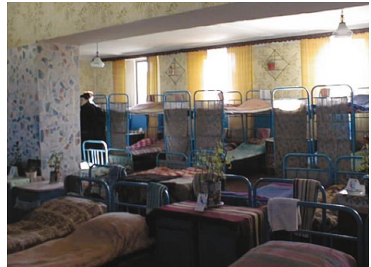
Needle exchange programs have proven effective in barracks-style facilities such as Prison Colony 18, Branesti, Moldova.

Prison needle exchange programs have been successfully implemented by taking into account not only institutional size, security level, or structure of the particular prison in which a program was started, but also the needs of the prisoner population. In the six countries examined for this report, needle exchange pilot projects have been initiated in response to high rates of HIV prevalence and/or high levels of injection drug use within prisons. Once this need has been recognized, in each jurisdiction examined, prisons have shown flexibility and creativity by implementing a needle exchange program adapted to the needs of the particular population and institutional set-up in an institution.