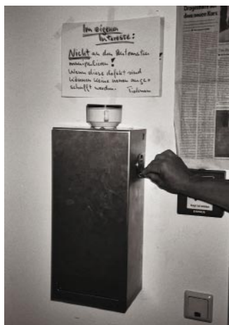
Syringe dispensing machine, Lichtenberg Prison, Berlin.

As in Switzerland, prisoners participating in the program were given a "dummy" needle that could be inserted into a dispensing machine to release a sterile needle. Following this, a new needle could be obtained on a one-for-one basis by inserting a used syringe into the machine. In addition to providing sterile syringes, the machines also dispensed other harm-reduction materials necessary to practise safe injection. These included alcohol swabs, ascor-