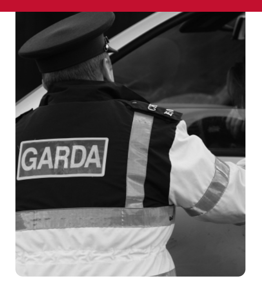
'Ireland is a jurisdiction with great potential for the use of noncustodial sanctions as a means of reducing the prison population.'

Short prison terms are a particularly pointless form of imprisonment placing a huge strain on penal resources with minimal deterrent or rehabilitative effect. This apparent over-use of short sentences would suggest that Ireland is a jurisdiction with great potential for the use of non-custodial sanctions as a means of reducing the prison population.